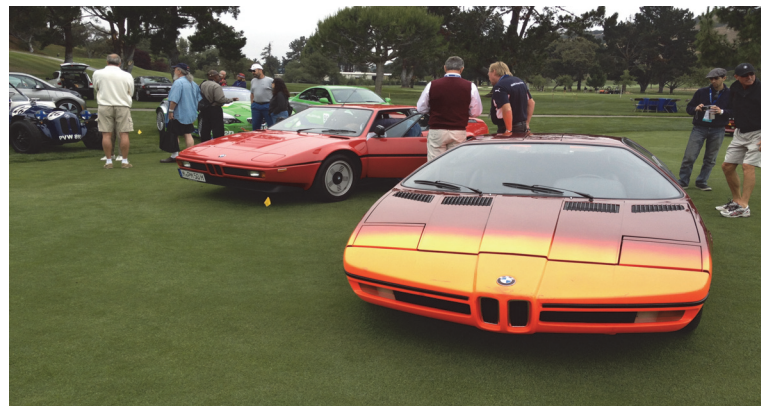
The “Turbo” and M1 also caused quite a stir at the 2013 Oktoberfest concours event.

Please reference an upcoming Roundel for more detailed coverage of this growing and prestigious event. (ed.)