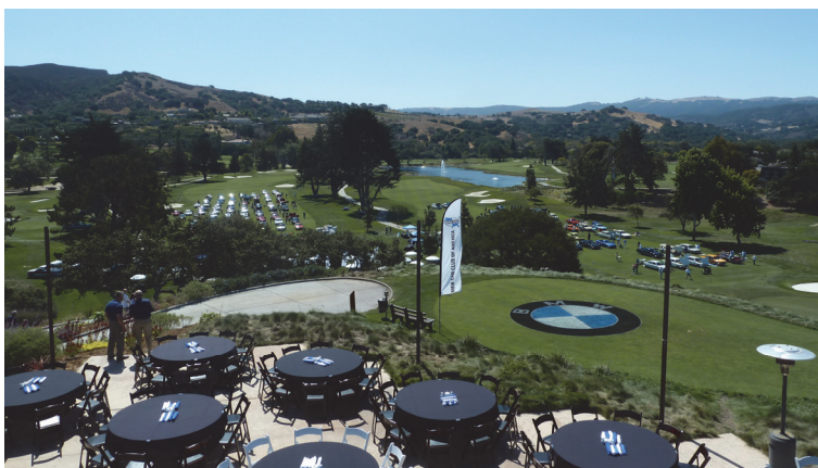
The stunning overview of Corral del Tierra, site of the ofest Concours.

When it was announced that the 2013 O'fest was to be held immediately after the Monterey Sports Car Weekend, I thought 'how neat' and then 'how foolish'. My first thought was correct. In what has to be one of the most attended of recent memory, if not the most attended, all attendees were treated to a memorable event. From a classy concours at a spectacular golf course, to several days of driving schools at Laguna Seca to a surprise reception for the new M4 it was all over the top. Hats off to BMW CCA National for pulling this one off!